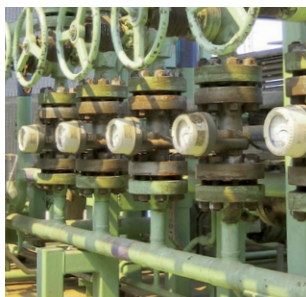
VA Master in high pressure methanol injection application